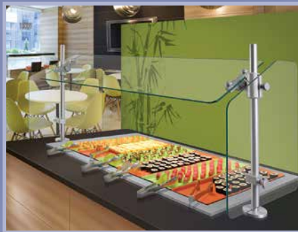
SGCP-48 pg. 2