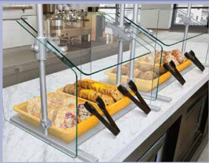
SGPT-30 pg. 2

Cafeterias • Convenience Stores Supermarkets & Delis • Restaurants & Cafés Clubs & Bars • Catering • Concessions