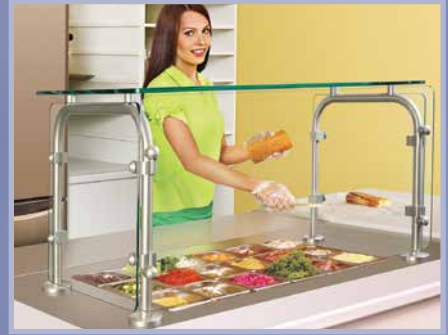
SGEN-40 pg. 2