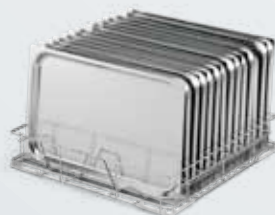
14 x 1/1 GN