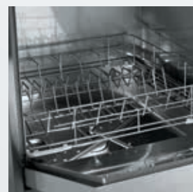
Stainless steel rack