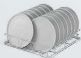
14 x 320mm pizza plate