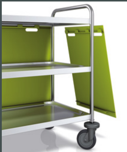
The side walls Simple to hook in and just as easy to remove.

In addition to stainless steel, the panelling is available in thirteen different colours, all of which make the serving trolley a real eye-catcher in any surroundings.